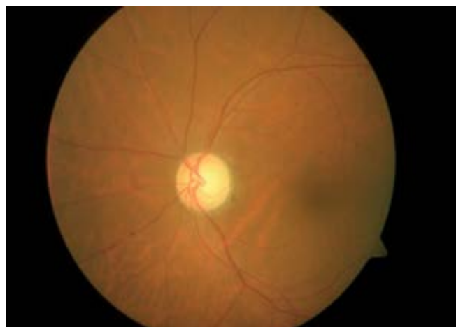
Figure 4. Left Eye of a 49-year-old gentleman showing temporal optic nerve pallor - left retro bulbar neuritis