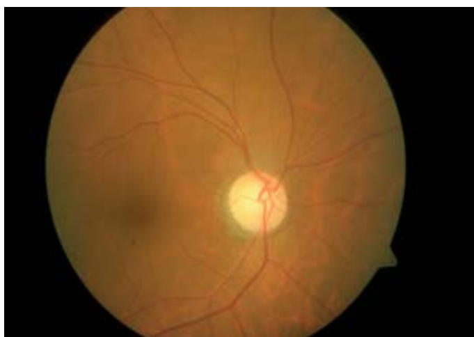
Figure 3. Right Eye of a 49-year-old gentleman showing temporal optic nerve pallor - more than that seen at first visit

He was regularly followed up and was in remission on treatment for one year till May 2016 after which the dose of Mycophenolate was reduced to 500 mg/day. Within 5 months of this dose reduction; in October 2016, he had a second relapse; this time in the left eye with a drop-in vision to 20/60, N8, although with normal colour vision. Optic Nerves showed a temporal optic nerve pallor in both eyes Figure 3 and Figure 4. with no nerve fiber layer odema but a central scotoma in the left eye suggestive of a left Retrobulbar Neuritis.