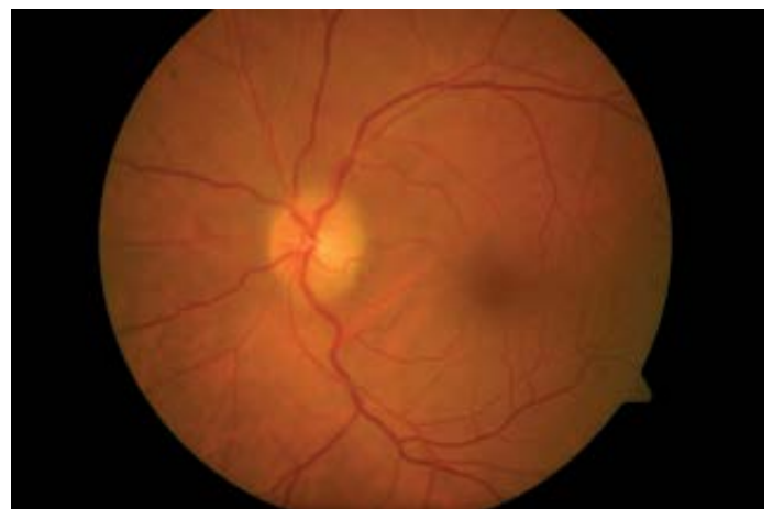
Figure 2: Left Eye of a 49-year-old gentleman showing optic neuritis