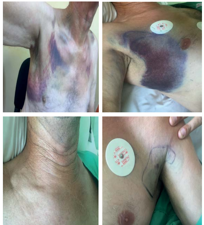
Figure 1. Edema and Gauge Hematoma of the Patient at the Emergency Room

After CT examination and of thyroid artery aneurysm resulting in hemomediastinum causing thoracic pain.